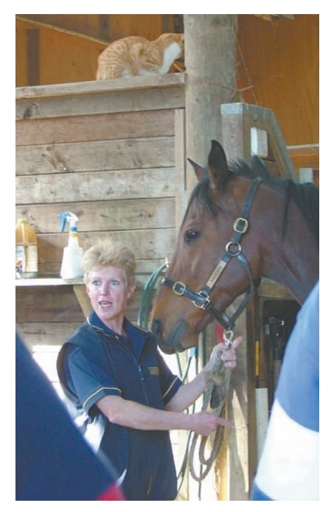
Parents are coached on their horse's behavioural issues.

Because Abderry's facilities are so substantial it makes sense to continued on page 22